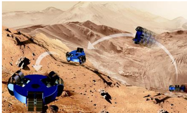
Figure 1. Galago is a light and symmetric jumping robot, here jumping in a Valles Marineris-type landscape.

Summary: Field geoscientists need to collect three-dimensional data in order to characterise the lithologic succession and structure of terrains, reconstruct their evolution, and eventually reveal the history of a portion of the planet. This is achieved by walking up and down mountains and valleys, conducting and interpreting geological and geophysical traverses, and reading measures made at stations located at key sites on mountain peaks or rocky promontories. These activities have been denied to conventional planetary exploration rovers because engineering constraints for landing and travelling are strong, especially in terms of allowed terrain roughness and slopes. On the smallest bodies, rovers are ineffective because gravity is not enough for friction to occur between wheels and the ground. Galago, the Highland Terrain Hopper, a new, light and robust locomotion system currently in development (equiv. ESA TRL stages 2-4), addresses the challenge of accessing most areas on low-gravity planetary bodies for performing scientific observations and measurements, alone or as part of a Galago commando. An illustration is given in the Valles Marineris mountains.